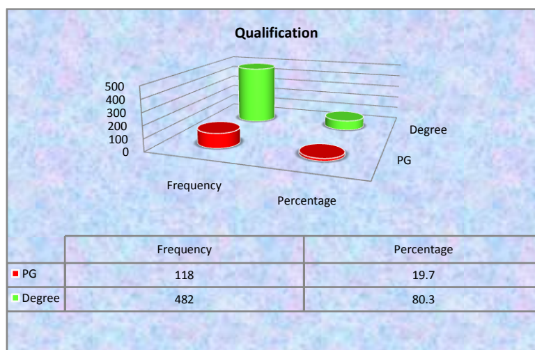
Figure showing distribution of student teachers - Qualification

The above table 4.3 shows Educational qualification of distribution of the student teachers. Out of the total of 600 student teachers, 118 were Post Graduates and 482 were Graduates. It is evident from the above table that 80.3% of the student teachers were Graduates and 19.7% were Post Graduates. Thus it can be concluded that majority (80%) of the sample consists of Graduates and the other 20% of sample belonged to Post Graduates.